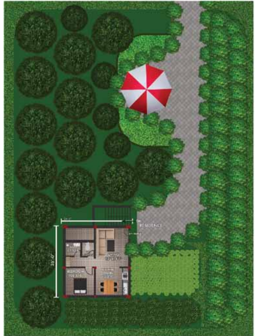
An Architect's view of Individual Plot