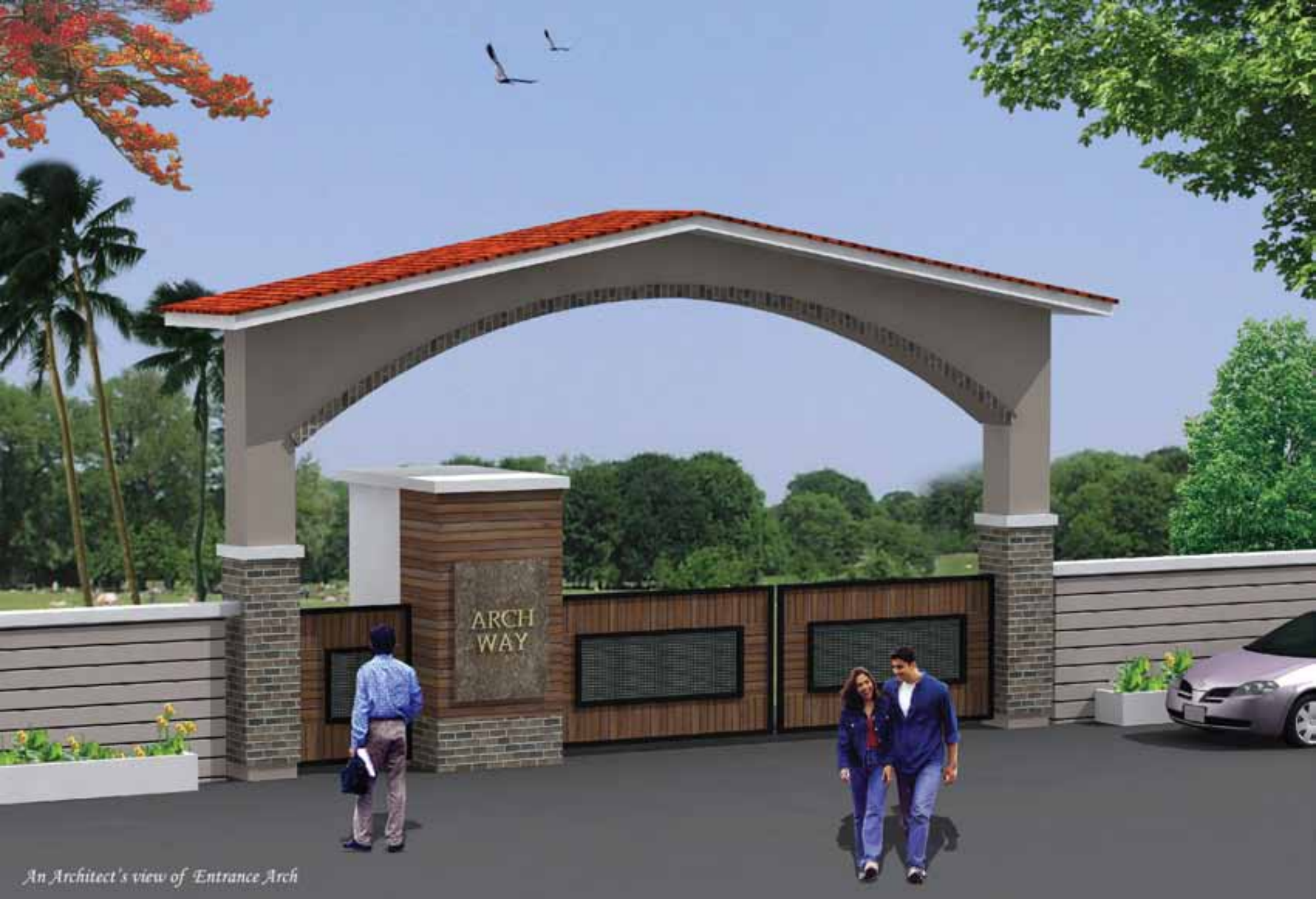
An Architect's view of 'Entrance Arch'